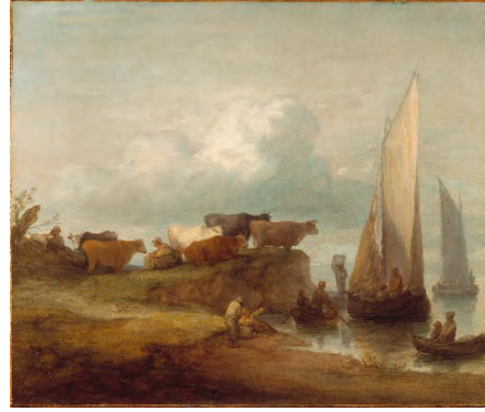
Thomas Gainsborough (1727–1788), A Coastal Landscape , about 1782–84. Oil paint on canvas; 25-1/8 x 30-1/8 in. Promised Gift of the Berger Collection Educational Trust, inv. TL-18382.