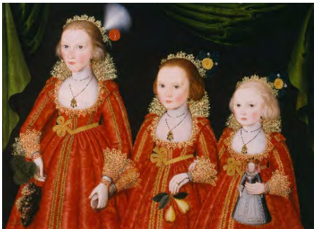
Follower of William Larkin (about 1580-1619), Three Young Girls , about 1620. Oil on panel; 33-1/2 x 46 in. Promised Gift of the Berger Collection Educational Trust, inv. TL-18018.