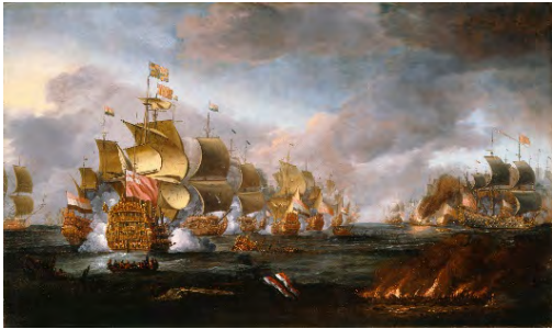
Adriaen van Diest (1655–1704), The Battle of Lowestoft , about 1690. Oil paint on canvas; 40-3/4 x 71-1/4 in. Promised Gift of the Berger Collection Educational Trust, inv. 8.2010