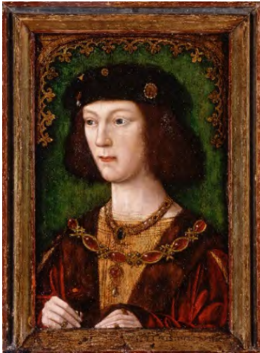
British School, Henry VIII , about 1513. Oil paint on panel, housed in its original frame; 15 x 9-3/4 in. Promised Gift of the Berger Collection Educational Trust, inv. TL-17964.