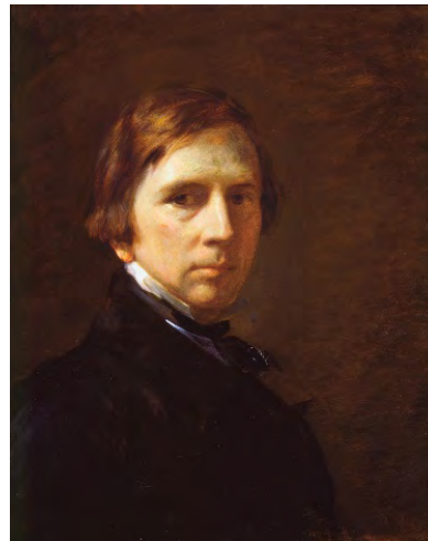
George Richmond (1809-1896), Self-Portrait , about 1840. Oil paint on canvas; 23-1/2 x 18-1/2 in. Gift of the Berger Collection Educational Trust, inv. 2018.27