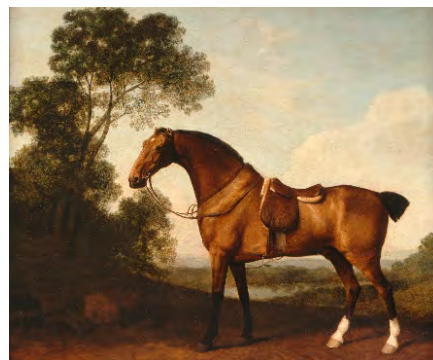
George Stubbs (1724-1806), A Saddled Bay Hunter , 1786. Oil paint on panel; 21-3/4 x 27-3/4 in. Promised Gift of the Berger Collection Educational Trust, inv. TL-18021.