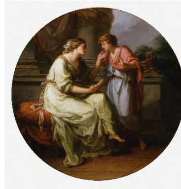
Angelica Kauffman (1741-1807), Papirius Praetextatus Entreated by His Mother to Disclose the Secrets of the Deliberations of the Roman Senate , about 1775-80. Oil paint on canvas; Diameter: 24-1/16 in. Promised Gift of the Berger Collection Educational Trust, inv. TL-17722.