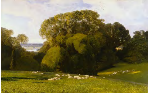
Edward Lear (1812–1888), Nuneham , 1860. Oil paint on canvas; 18-3/4 x 29-1/4 in. Gift of the Berger Collection Educational Trust, inv. 2018.22.