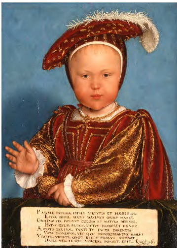
Hans Holbein the Younger and studio (1497/8–1543), Edward, Prince of Wales (later Edward VI) , about 1538. Oil paint on panel; 22-3/4 x 17 in. Promised Gift of the Berger Collection Educational Trust, inv. TL-17310.