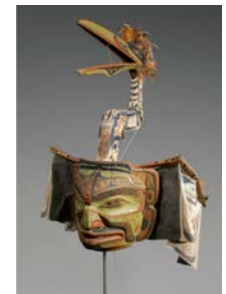
Attributed to Charlie James and Mungo Martin (Kwakwaka'wakw), Mask , 1900. Feathers, wood, paint, thread and fabric; overall 48-1/2 x 82 in. Denver Art Museum: Purchase from the University of Washington, 1953.402.