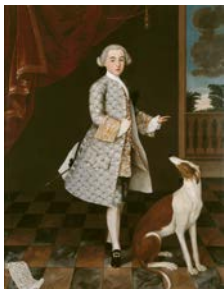
Anonymous (Mexico), Portrait of Francisco de Orense y Moctezuma Count of Villalobos , 1761. Oil paint on canvas; 74 x 59 in. Denver Art Museum: Gift of Frederick and Jan Mayer; 2011.427.