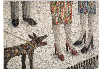
Gugger Petter, Dog Barking at Two Women , 2008. Woven hemp and newspaper with paint; 54 x 78 x 3 in. Neusteter Textile Collection: Funds from Mary Dean Reed and Fortune Morrison by exchange, 2008.894. © Gugger Petter