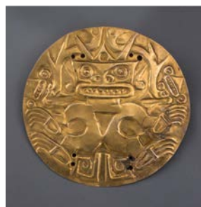
Unknown Artist, Breastplate with Frontal Figure , Parita style (Parita region, Azuero Peninsula, Central Panama) about A.D. 1150-1400. Gold alloy; 5-1/4 in. Denver Art Museum: Department acquisition funds, 1965.196.