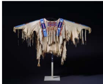
Nez Perce artist, Shirt , about 1885. Leather, ermine, glass beads and paint; 38 x 58 x 65-1/2 in. (sleeves extended). Denver Art Museum: Native Arts acquisition fund, 1940.26.