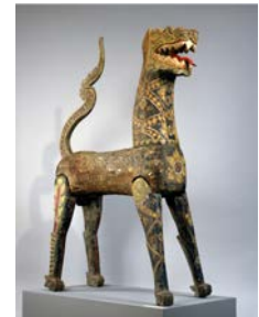
Guardian Lion (Northern Thailand), 1600s-1800s. Polychromed wood; 82-1/2 x 27 x 59-1/2 in. Denver Art Museum: Gift of Roberto Agnolini, 1985.18.