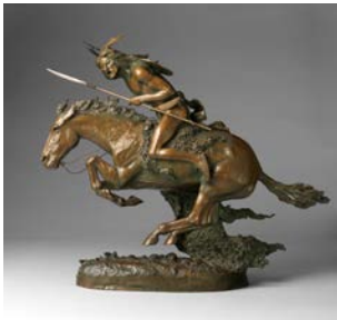
Frederic Remington, The Cheyenne , modeled 1903 (cast by 1903). Bronze; 20-7/8 x 24-3/8 x 7-1/2 in. Denver Art Museum: funds from the William D. Hewitt Charitable Annuity Trust, 1981.14A-B.