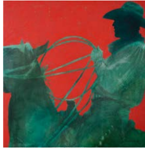
Duke Beardsley, Against the Bit , 2007. Oil on canvas; 36 x 36 in. Denver Art Museum: Funds from the Contemporary Realism Group, 2007.51. © Duke Beardsley