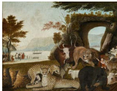
Edward Hicks, The Peaceable Kingdom , about 1847. Oil paint on canvas; 23-3/4 x 31-1/8 in. Denver Art Museum: Gift of Charles Bayly, Jr.