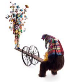
Nick Cave, Untitled , 2013. Mixed media, including mannequin, fabric, hot pads, vintage toys, synthetic hair, and seesaw; 141 x 166 x 45 in. Denver Art Museum: Purchased with Modern and Contemporary acquisition funds and the support of Vicki and Kent Logan, 2013.76A-F. © Nick Cave