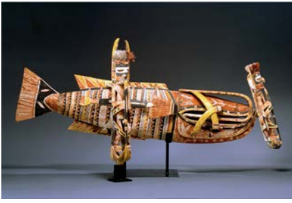
Papua New Guinea artist, Malagan Figures , mid-1900s. Wood, paint, fiber and shell; 88 x 12 x 41 in. Denver Art Museum: Gift of Joan and George Anderman, 2001.177A-C.