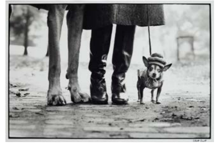
Elliot Erwit, New York City , 1974. Gelatin silver print; sheet height: 20 x sheet width: 24 in. Denver Art Museum: Balan and Joe Joe in honor of Hal Gould, 2011.245.