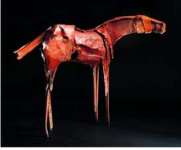
Deborah Butterfield, Orion , 1988. Painted steel; 82 x 30 x 106 in. Denver Art Museum: Funds from Bonfils-Stanton Foundation, 1988.163. © Deborah Butterfield