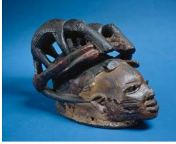
Yoruba artist, Dance Headdress , no date. Carved wood with dark brown, black and red pigment; 11 x 10-1/2 x 16 in. Denver Art Museum: Anonymous Gift, 2001.1097.