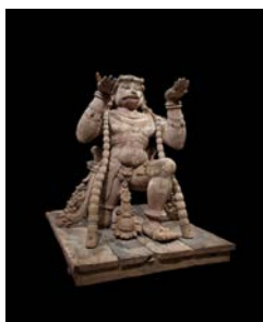
Monkey God (Hanuman), Southern India, 1800s. Wood with pigment, iron; 42-1/4 x 35-1/2 x 38-1/2 in. Denver Art Museum: Funds from 1983 Collector's Choice, 1991.1012.