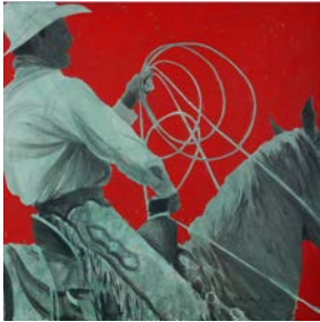
Duke Beardsley, Burnin' Rubber , 2006. Oil on canvas; 36 x 36 in. Denver Art Museum: Funds from the Contemporary Realism Group, 2007.52. © Duke Beardsley

Press Office, 720-913-0000 pressoffice@denverartmuseum.org