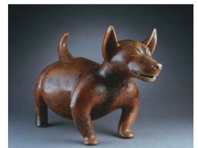
Unknown Artist, Standing Dog , Comala style (State of Colima, Western Mexico, Mexico), about 300 B.C.-A.D. 300. Slip-painted ceramic; 10-1/2 x 8 x 16 in. Denver Art Museum: Gift of Laurence DiRosario, 1970.292.