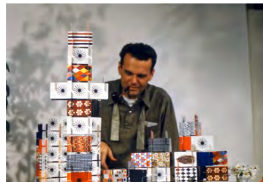
Charles Eames with House of Cards construction, 1952.