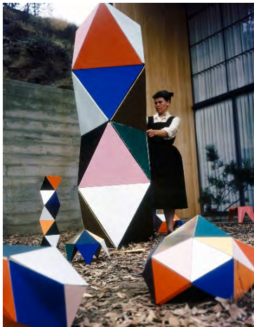
Ray Eames with the first prototype of The Toy, 1950.