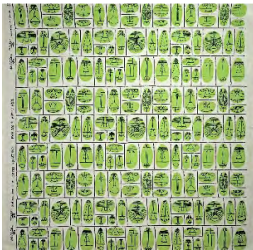
Ray Komai, Masks textile, 1948-49. Screenprint on cotton; 50-3/8 x 52 in. Manufactured by Laverne Originals. Collection of Edgar Orlaineta.