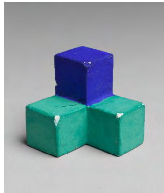
Isamu Noguchi, study model for Play Cubes (4-Cube element), c. 1965-68. Plaster; 1 x 1 x 1 in. The Isamu Noguchi Foundation and Garden Museum, New York.