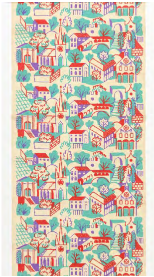
Alexander Girard, Village textile, 1945. Screenprint on linen; 91-3/4 x 35-7/8 in. Cooper Hewitt, Smithsonian Design Museum: Gift of Alexander H. Girard, 1969-165-59.