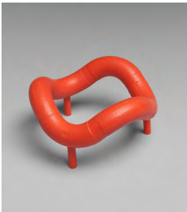
Isamu Noguchi, study model for Play Sculpture, about 1965-68. Plastic; 7/8 x 2-1/2 x 2-1/2 in. The Isamu Noguchi Foundation and Garden Museum, New York.