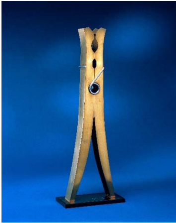
Claes Oldenburg, Clothespin—4 Foot Version A.P. IV , 1974. Bronze and stainless steel on acrylic base; 48 x 16-1/4 x 7 in. Denver Art Museum: Funds from Alliance For Contemporary Art, Brownstein, Hyatt, Farber & Madden, Kenneth M. Good, 1981.11. © 2018 Claes Oldenburg.