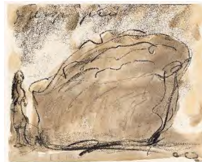
Claes Oldenburg, Sketch for a Soft Sculpture in the Form of a Cake Wedge- Woman for Scale , 1962. Wax crayon and watercolor on paper; 11 x 13-11/16 in. Whitney Museum of American Art, New York: Gift of The American Contemporary Art Foundation, Inc., Leonard A Lauder, President, 2002.9. © 2018 Claes Oldenburg.