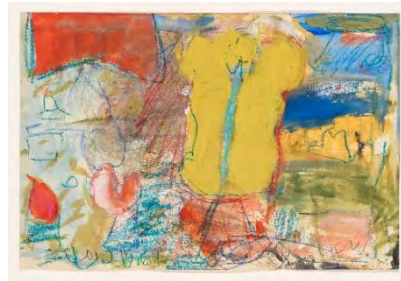
Claes Oldenburg, Store Window—Yellow Shirt, Red Bow Tie , 1961. Wax crayon and watercolor on paper; 11-13/16 x 17-1/2 in. Whitney Museum of American Art, New York: gift of The American Contemporary Art Foundation, Inc., Leonard A. Lauder, President 2002.7. © 2018 Claes Oldenburg.