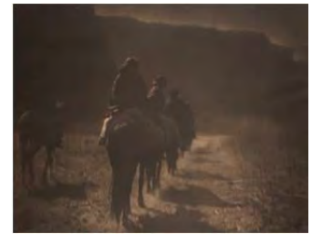
Edward S. Curtis, The Vanishing Race—Navaho , 1904. Platinum print; 16 x 20-3/4 in. Denver Art Museum: The Daniel Wolf Landscape Photography Collection, 1991.101