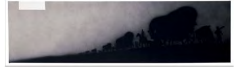
Ed Ruscha, Uncertain Frontier , 1987. Acrylic on canvas; 20 x 80 in. Orange County Museum of Art, Newport Beach, California: Commissioned by the Laguna Art Museum with funds provided by the Alice Van Camp Memorial Fund; inv. LAM.1987.016 ©Ed Ruscha