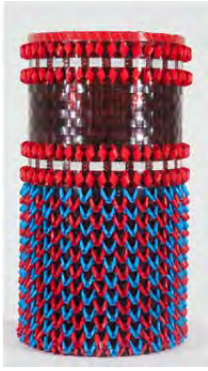
Gail Tremblay, It Was Never About Playing Cowboys and Indians , 2012. 16 mm film, leader, rayon cord, and thread; 24-1/4 x 14 in. diameter. Denver Art Museum: Native Arts acquisition fund, 2017.1