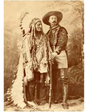
William Notman, Sitting Bull and Buffalo Bill, Montreal, Quebec , about 1885. Cabinet card photograph; 5-1/2 x 4 in. Buffalo Bill Museum and Grave, Golden, Colorado