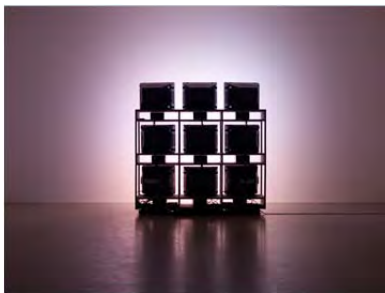
Spencer Finch, West (Sunset in my Motel Room, Monument Valley, January 26, 2007, 5:36–6:06 PM) , 2007. Nine-channel synchronized video installation with nine TV monitors. Variable dimensions; 31 min. 5 sec. ©Spencer Finch. Courtesy James Cohan, New York