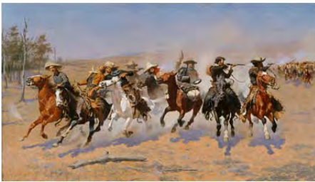
Frederic Remington, A Dash for the Timber , 1889. Oil on canvas; 48-1/4 x 84 in. Amon Carter Museum of American Art, Fort Worth, Texas, Amon G. Carter Collection