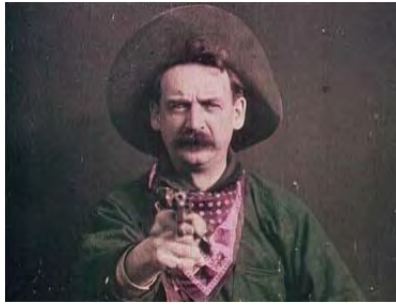
Justus D. Barnes in The Great Train Robbery , directed by Edwin S. Porter (uncredited), Edison Manufacturing Company, 1903.