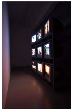
Spencer Finch, West (Sunset in my Motel Room, Monument Valley, January 26, 2007, 5:36–6:06 PM) , 2007. Nine-channel synchronized video installation with nine TV monitors. Variable dimensions; 31 min. 5 sec. ©Spencer Finch. Courtesy James Cohan, New York