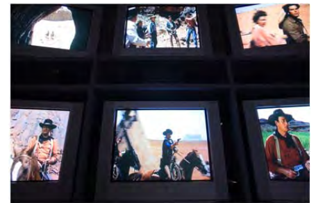
Spencer Finch, West (Sunset in my Motel Room, Monument Valley, January 26, 2007, 5:36–6:06 PM) , 2007. Nine-channel synchronized video installation with nine TV monitors. Variable dimensions; 31 min. 5 sec. ©Spencer Finch. Courtesy James Cohan, New York