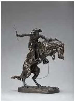
Frederic Remington, The Broncho Buster , 1895, cast before May 1902. Bronze; 23-1/4 x 22 x 13 in. Denver Art Museum: The Roath Collection, 2013.91