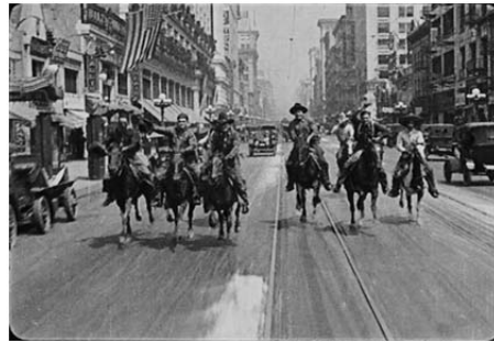
Bucking Broadway (film still), 1917. Directed by John Ford, with Harry Carey, Molly Malone and L.M. Wells.