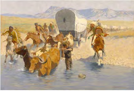
Frederic Remington, The Emigrants , about 1904. Oil on canvas; 30-3/8 x 45-3/8 in. Museum of Fine Arts, Houston, Texas, The Hogg Brothers Collection, Gift of Miss Ima Hogg, 43.15.