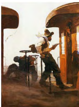
N. C. Wyeth, The Great Train Robbery , 1912. Oil on canvas; 44 x 33-1/8 in. Private collection