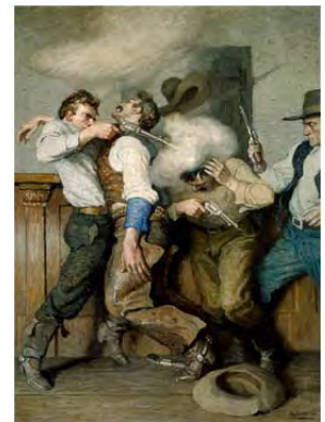
N. C. Wyeth, Gunfight , about 1916. Oil on canvas; 33-1/2 x 24-5/8 in. Denver Art Museum: William Sr. and Dorothy Harmsen Collection, 2001.443