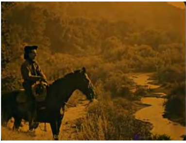
Scene from Bucking Broadway , directed by John Ford, Universal Film Manufacturing Company, 1917.