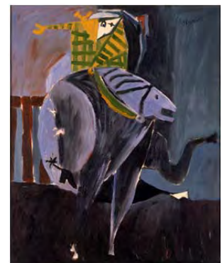
Roy Lichtenstein, Cowboy on Bronco , about 1953. Oil on canvas; 32 x 26 in. Butler Institute of American Art, Anonymous Gift, 1958.