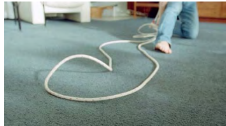
Salla Tykkä, Lasso (film still), 2000. Single-channel video with stereo sound; 4 min. 6 sec., format 16:9.