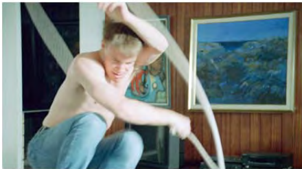
Salla Tykkä, Lasso (film still), 2000. Single-channel video with stereo sound; 4 min. 6 sec., format 16:9.