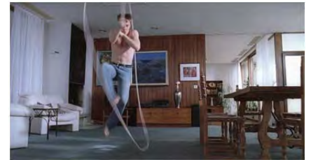
Salla Tykkä, Lasso (film still), 2000. Single-channel video with stereo sound; 4 min. 6 sec., format 16:9.