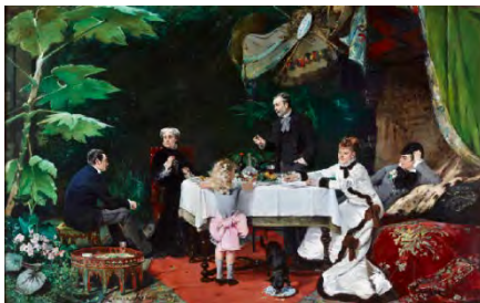
Louise Abbéma (French, 1853-1927), Lunch in the Greenhouse (Le déjeuner dans la serre), 1877. Oil on canvas; 76-3/8 x 121-1/4 in. Musée des Beaux-Arts, Pau, France.