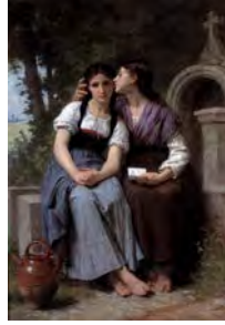
Elizabeth Gardner Bouguereau (American, 1837-1922); La Confidence, ca. 1880. Oil on canvas; 68 x 47-1/8 in. Georgia Museum of Art, Athens.