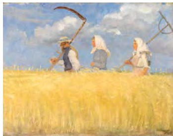
Anna Ancher (Danish, 1855-1935), The Harvesters, 1905. Oil on canvas; 17-1/8 x 22-1/8 in. Art Museums of Skagen, Denmark, SKM1465.