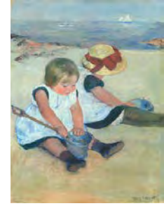
Mary Cassatt (American, 1844-1926), Children Playing on the Beach, 1884. Oil on canvas; 38-3/8 x 29-3/16 in. National Gallery of Art, Washington D.C., Alisa Mellon Bruce Collection, 1970.17.19.