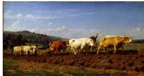
Rosa Bonheur (French, 1822-1899), Plowing at Nivernais, 1850. Oil on canvas; 52-1/2 x 102 in. Bequest of John Ringling, 1936, SN433, Collection of the John and Mable Ringling Museum of Art, the State Art Museum of Florida, Florida State University, Sarasota, Florida.