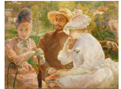
Marie Bracquemond (French, 1840-1916), On the Terrace at Sèvres (Sur la terrasse à Sèvres), 1880. Oil on canvas; 34-5/8 x 45-1/4 in. Musée du Petit Palais, Geneva.