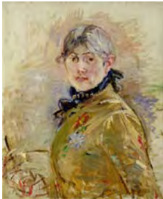
Berthe Morisot (French, 1841-1895), Self-Portrait, 1885. Oil on canvas; 24 x 19-11/16 in. Musée Marmottan Monet, Paris, 6022.