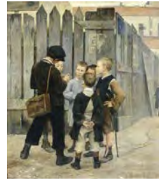
Marie Bashkirtseff (Ukrainian, 1858-1884), The Meeting, 1884. Oil on canvas; 76 x 69-11/16 in. Musée d'Orsay, Paris.