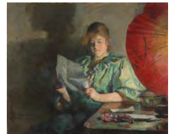
Harriet Backer (Norwegian, 1845-1932), Evening, Interior, 1890. Oil on canvas; 32 x 34 in. National Museum of Art, Architecture, and Design, Oslo, NG.M.02216