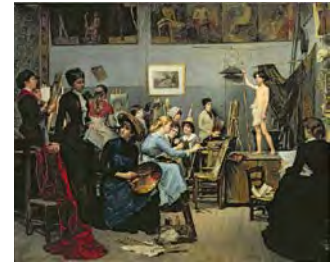
Marie Bashkirtseff (Ukrainian, 1858-1884), In the Studio, 1881. Oil on canvas; 60-5/8 x 73-1/4 in. Dnipropetrovsk State Art Museum, Ukraine KH-4234.