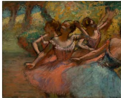
Edgar Degas, Four Ballet Dancers on Stage , 1885--90. Oil paint on canvas; 28-3/4 x 36-1/4 in. Collection of Museu de Arte de São Paulo, Assis Chateaubriand, Brazil.