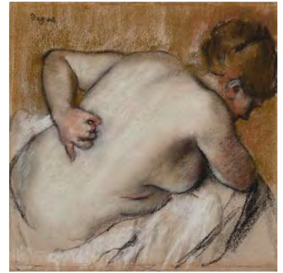
Edgar Degas, Woman Scratching Her Back , 1881. Pastel on paper; 15-7/8 x 16-1/4 in. Denver Art Museum: The Edward & Tullah Hanley Memorial Gift for the People of Denver and the area, 1973.161.