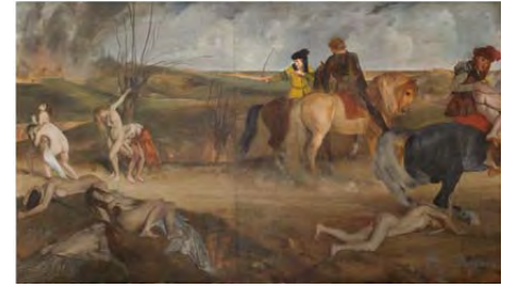
Edgar Degas, War Scene in the Middle Ages (Scène de guerre au Moyen Age) , about 1865. Oil and petrol on paper glued on canvas; 32-7/8 x 58-7/16 in. Musée d'Orsay, Paris