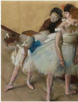
Edgar Degas, Dance Examination (Examen de Danse) , 1880. Pastel on paper; 24-1/2 x 18 in. Denver Art Museum: anonymous gift, 1941.6