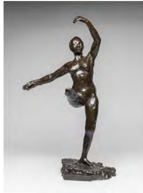
Edgar Degas, Dancer, Fourth Position in Front on the Left Leg, wax original about 1885-1890, cast about 1919-1921. Copper alloy; 22-15/16 x 14-9/16 x 14-3/16 in.