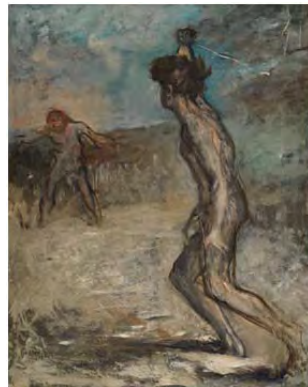
Edgar Degas, David and Goliath , 1859. Oil paint on canvas; 25-1/8 x 31-1/2 in.