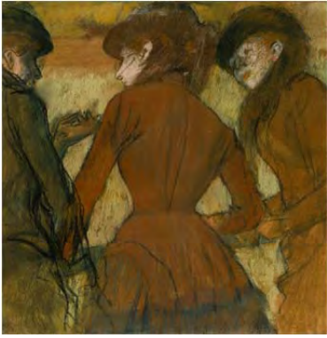
Edgar Degas, Three Women at the Races (Trois femmes aux courses) , about 1885. Pastel on paper; 27 x 27 in. Denver Art Museum: anonymous gift, 1973.234