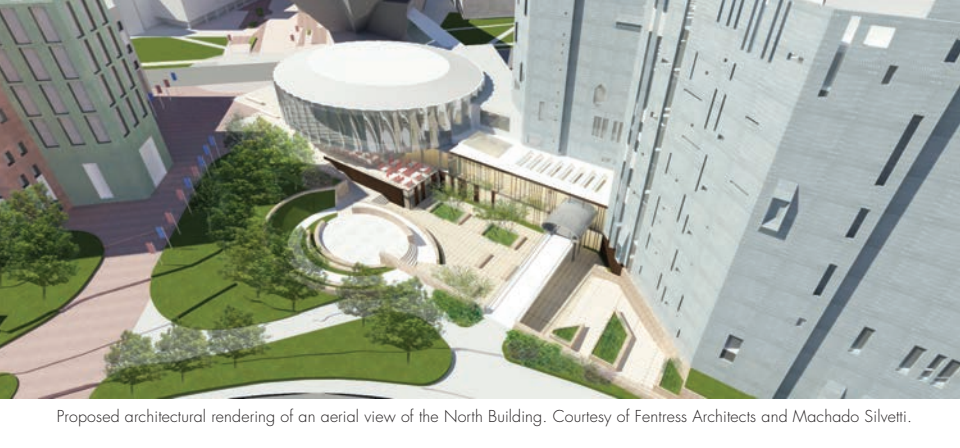
Proposed architectural rendering of an aerial view of the North Building. Courtesy of Fentress Architects and Machado Silvetti.