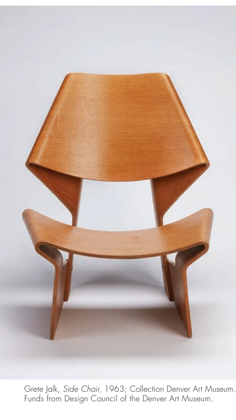
Grete Jalk, Side Chair , 1963; Collection Denver Art Museum. Funds from Design Council of the Denver Art Museum.