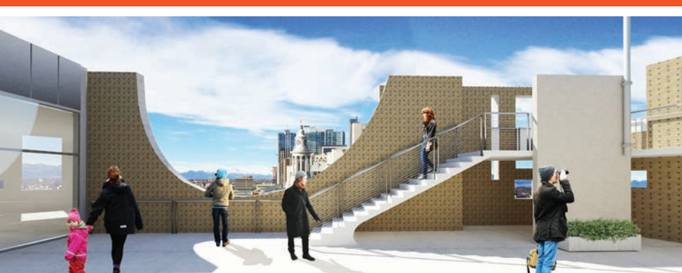
Proposed architectural rendering of terrace on Level 7 of the North Building. Courtesy of Fentress Architects and Machado Silvetti.