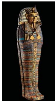
Tutankhamun canopic coffinette. 15.4 in.

These golden sandals have engraved decoration that replicates woven reeds. Created specifically for the afterlife, they still covered the feet of Tutankhamun when Howard Carter unwrapped the mummy.