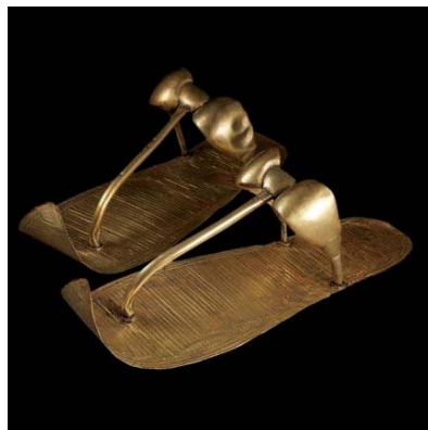
Tutankhamun's golden sandals.

This colossal statue of Tutankhamun was found at the remains of the funerary temple of Ay and Horemheb. The belt is inscribed with the name Horemheb, written over the earlier names of Ay and Tutankhamun.