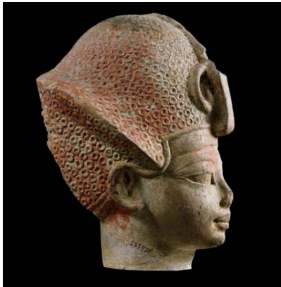
Head of Amenhotep III in the Blue Crown.

From the Karnak Temple Cachette, this rather unusual statue was modeled in unbaked clay with the features of King Amenhotep III, in particular those seen near the end of his reign.