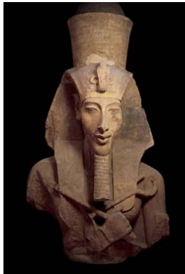
Colossal statue of Amenhotep IV / Akhaten.

This fan, found in the burial chamber, was inlaid with multicolored glass and includes two cartouches of Tutankhamun at its center. Fans were a symbol of kingship, and were carried behind the pharaoh to protect him from the sun.