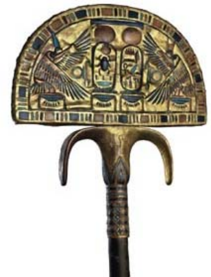
Fan.

Found on the body of Neferuptah, daughter of Amenemhat III, this collar might have been worn in life and was included in the tomb for her use in the afterlife.