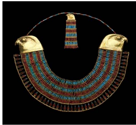
Collar of Neferuptah.

From the Karnak Temple Cachette, this rather unusual statue was modeled in unbaked clay with the features of King Amenhotep III, in particular those seen near the end of his reign.