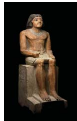
Statue of Inty-Shedu.

A large container with four hollowed out sections held the internal organs of the king. Each of its compartments had a lid in the form of Tutankhamun's head. The royal name on both the chest and its outer shrine appears original, suggesting that Tutankhamun did not usurp the container from a predecessor.