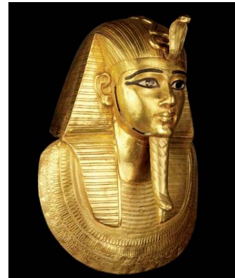
Funerary mask of Psusennes I.

The golden mask lay over the head, chest and part of the shoulders of the mummy of Psusennes, as a layer of protection. The royal headdress with ureaus cobra and the divine false beard he wears attested to his royal and godly status. The use of gold, considered the flesh of the gods, reaffirmed his divinity in the afterlife.