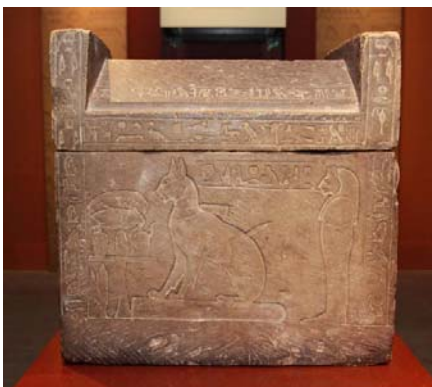
Sarcophagus of Prince Thutmose's cat.

The golden mask lay over the head, chest and part of the shoulders of the mummy of Psusennes, as a layer of protection. The royal headdress with ureaus cobra and the divine false beard he wears attested to his royal and godly status. The use of gold, considered the flesh of the gods, reaffirmed his divinity in the afterlife.