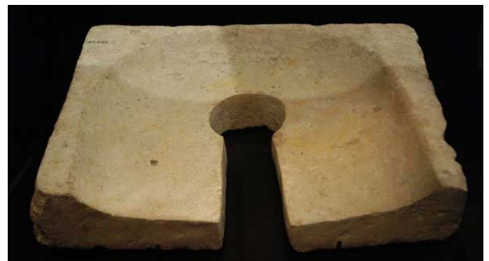
Latrine seat.

A smaller version of the stone boxes used to bury people, this sarcophagus held the body of the Prince's prized cat, Ta-Mit (literally, "female cat"), and is decorated with the funeral deities Isis, Nephthys, and the four sons of Horus.