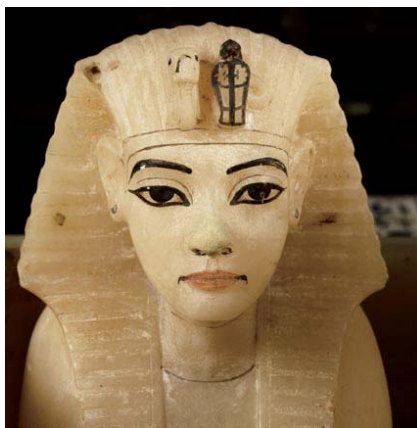
Canopic stopper.

The only such figure found in the Antechamber, it is one of the largest of the servant statuettes. The inscription records the shabti spell from the Book of the Dead, ensuring that the king would do no forced labor in the afterlife.