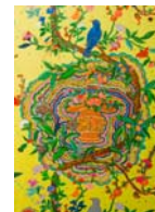
L to R: Untitled , 2005. Caution is the Greatest Thing (detail), 2009.