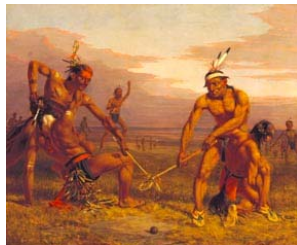
Charles Deas, Sioux Playing Ball , 1843. Gilcrease Museum, Tulsa, Oklahoma.