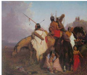
Charles Deas, Indian Group , 1845. Amon Carter Museum, Fort Worth, Texas.