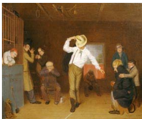
Charles Deas, Walking the Chalk , 1838. The Museum of Fine Arts, Houston. Museum purchase with funds provided by the Agnes Cullen Arnold Endowment Fund.