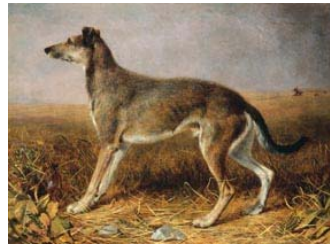
Charles Deas, Lion , 1841. Art Collection of the Minnesota Historical Society.