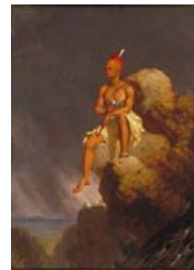
Charles Deas, A Solitary Indian, Seated on the Edge of a Bold Precipice , 1847.